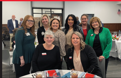
LEADING WITH IMPACT SUMMIT