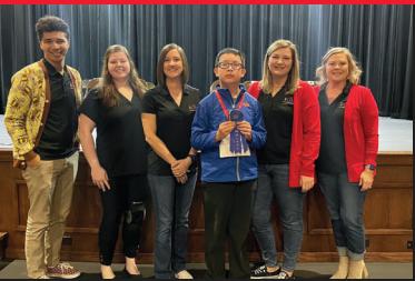
ECU REGIONAL SPELLING BEE